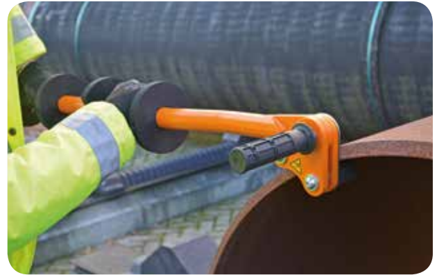
Pipe Roller in use

The rotating head prevents sudden movements of the Pipe Roller when the pipe starts to roll, reducing the risks of injuries significantly. The handguard avoids contact between your hand and the pipe. In combination with the handgrip on the rotating head, it allows the Pipe Roller to be used safely. The pin protectors on the pins protect the pipe and coating from damage.