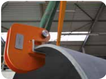
Pipe Hook Standard in use

The Pipe Hook Standard is developed for easy and efficient hoisting of tubes and pipes. A pair of hooks can be mounted on a crane with lifting cables. This safe handling tool is available in a variety of sizes.