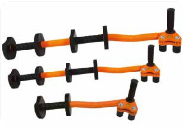
Pipe Roller large, medium and small