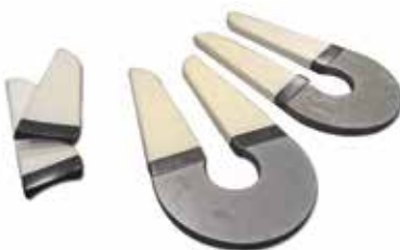
Pipe Clamp with coating protection

Maximum load Standard Pipe Clamp = 40 kN