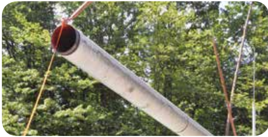
Pipe Hook Premium in use