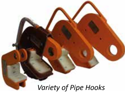
Variety of Pipe Hooks