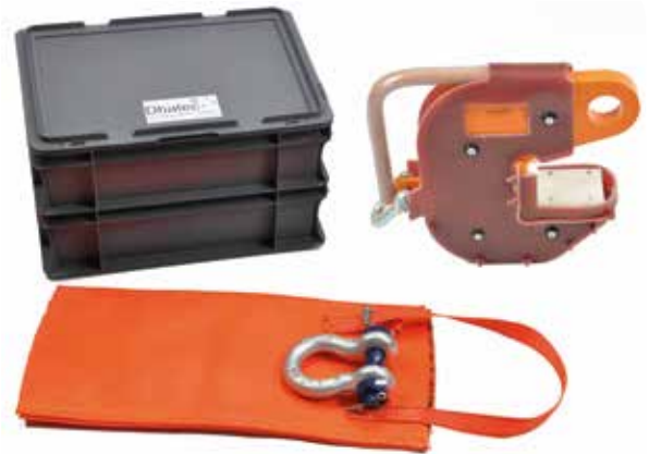
Pipe Hook Premium with PU Protection Sleeves, Pipe Hook box, Shackle and Shackle Protector