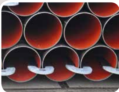
Pipe Clamp in use