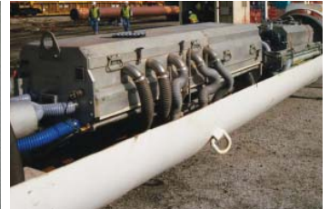
The cleaner and vacuum work in tandem to blast clean, vacuum and recycle grit on each internal field joint.