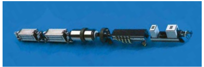
A full train of robotic equipment can apply corrosion prevention coatings to internal field joints.

The inspection robot also contains technology to view and record the radial location of any coating holidays and can also display parent-coating damage, debris, failed field-applied couplings and other anomalies. Visual and high-voltage inspection of the internal field joint adds a quality control aspect that is unmatched by other inspection processes.