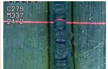
The Inspection Robot features a laser beam that detects unacceptable weld bead contours.